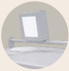
Motorized exhaust air flap for chamber kilns from 440 liters