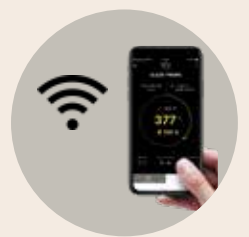
Mobile monitoring with the MyNabertherm app