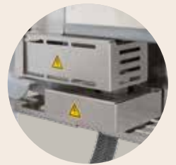
Protected door contact switch