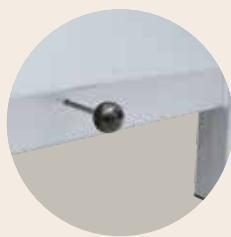
Manual air inlet sliding damper for chamber kilns from 440 liters