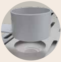
Exhaust air opening for chamber kilns up to 300 liters