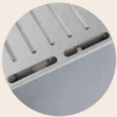
Dual shell housing provides for low temperatures