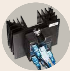
Solid state relays ensure low noise heater operation