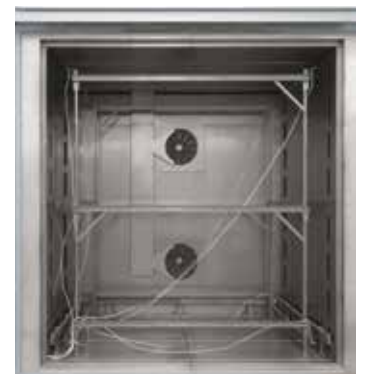
Pluggable frame for measurement for forced convection chamber furnace N 7920/45 HAS