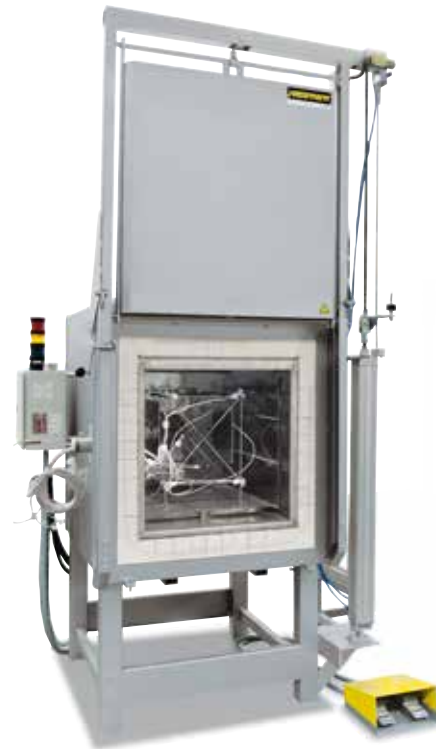
Holding frame for measurement of temperature uniformity

In standard furnaces a temperature uniformity is guaranteed as +/- K without measurement of temperature uniformity. However, as additional feature, a temperature uniformity measurement at a reference temperature in the work space compliant with DIN 17052-1 can be ordered. Depending on the furnace model, a holding frame which is equivalent in size to the work space is inserted into the furnace. This frame holds thermocouples at 11 defined measurement positions. The measurement of the temperature uniformity is performed at a reference temperature specified by the customer at a pre-defined dwell time. If necessary, different reference temperatures or a defined reference working temperature range can also be calibrated.