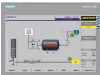
H3700 with colored graphic presentation

Nabertherm has many years of experience in the design and construction of both standard and custom control alternatives. All controls are remarkable for their ease of use and even in the basic version have a wide variety of functions.