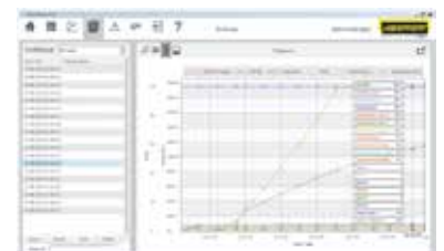
Graphic display of process curve