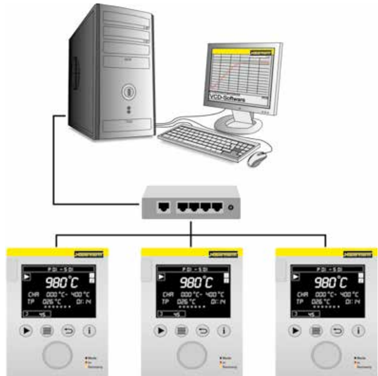
Example lay-out with 3 furnaces