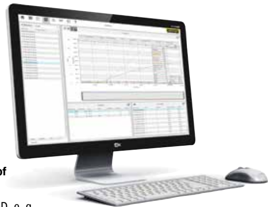
VCD Software for Control, Visualisation and Documentation