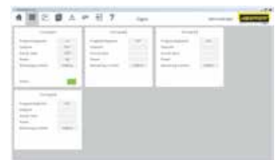
Graphic display of main overview (version with 4 furnaces)