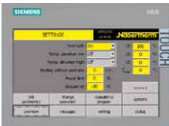
H1700 with colored, tabular depiction