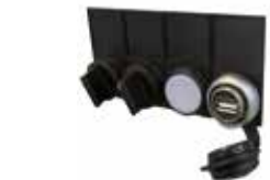
NTLog Comfort for data recording of a Siemens PLC

The extension module NTLog Comfort offers the same functionality of NTLog Basic module. Process data from a HiProSystems control are read out and stored in real time on a USB stick (not available for all H700 systems). The extension module NTLog Comfort can also be connected using an Ethernet connection to a computer in the same local network so that data can be written directly onto this computer.